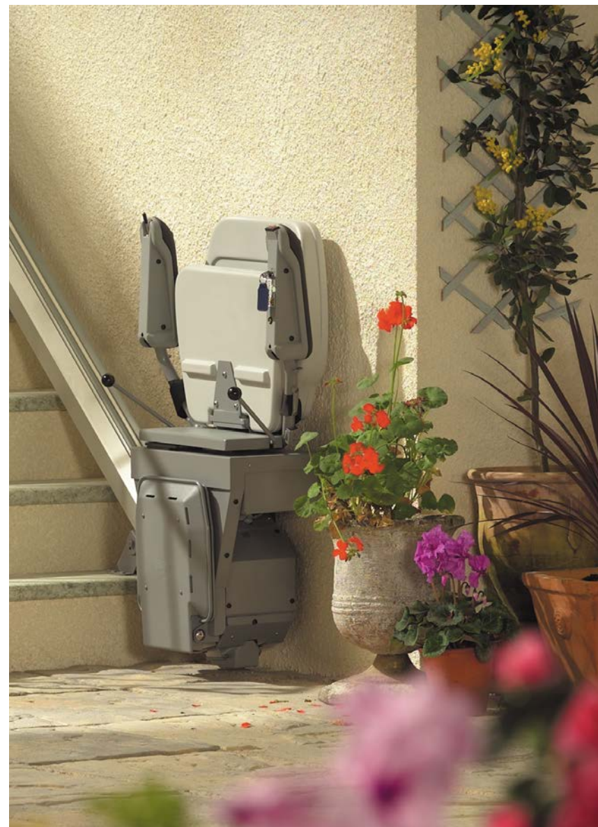
The Outdoor's slimline design allows others to still use the stairs

Fitted to the stairs and not to the wall, the Outdoor straight rail can only be fitted to solid concrete, solid wood or metal staircases.