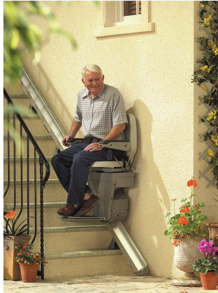
A gentle touch of the controls is all it takes to climb your stairs