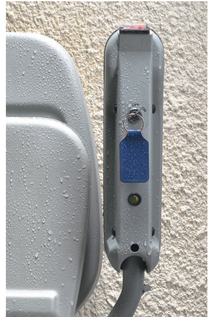
A removable power key adds additional security

"We are delighted with the stairlift. My wife enjoys the ride. It gives her independence. She finds it very easy to use"