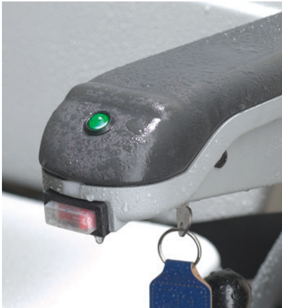
On-off light as standard for ease of use

Effortless and simple. This sums up beautifully just how much thought and care we have designed into each and every function of our Outdoor stairlift. From the safe and easy-to-use seatbelt, to a stairlift that takes up minimal space on your staircase, we have made your Outdoor stairlift simple, safe and reliable.