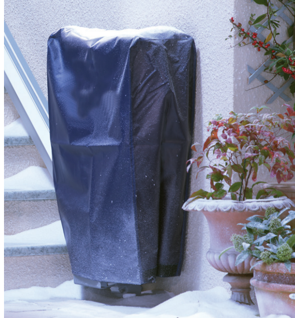
The Outdoor features a weatherproof cover