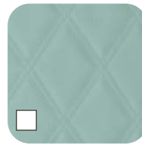
Duck Egg Blue