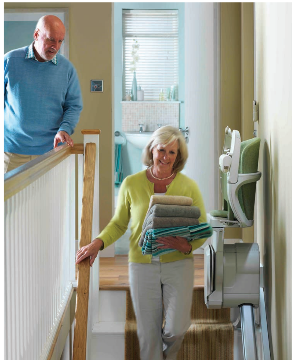
The Starla's slimline design allows others to still use the stairs

Tailor it to your tastes and home by choosing a fabric, with or without a light or dark wood finish or select the full vinyl upholstery in a range of sophisticated colours.